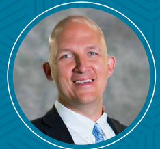
Mayor Gregory J. Oravec