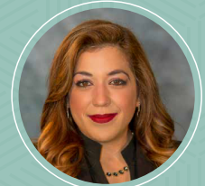
Vice Mayor Jolien Caraballo, District 4