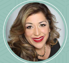
Vice Mayor Jolien Caraballo, District 4